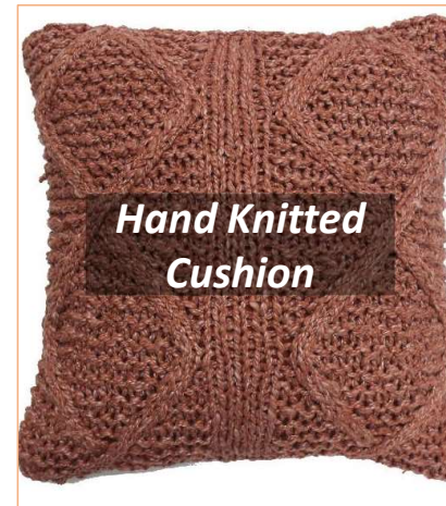
Hand Knitted Cushion