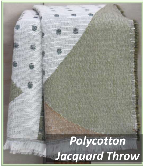
Polycotton Jacquard Throw