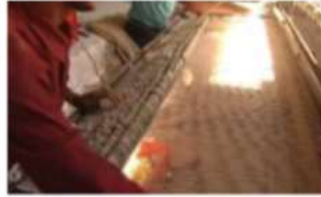
SHAGGY RUGS (PIT LOOMS)