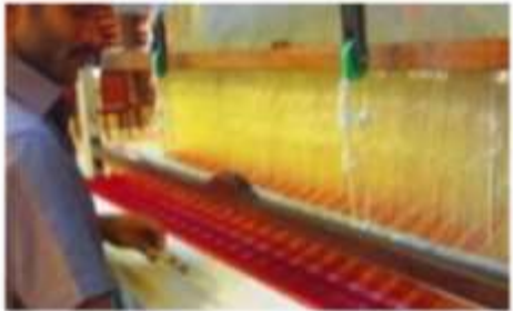
HAND WOVEN (HAND LOOM CARPETS)