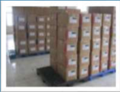
FINISHED GOODS WARE HOUSE