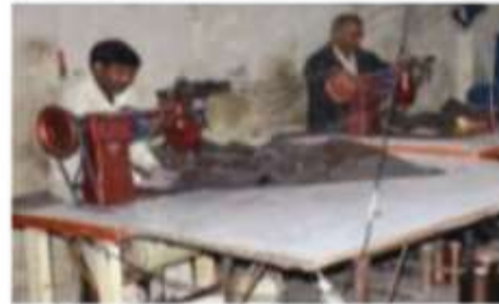
TABLE TUFTED (LARGE SIZE RUGS)