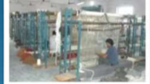
HAND WOVEN (PUNJA LOOMS)