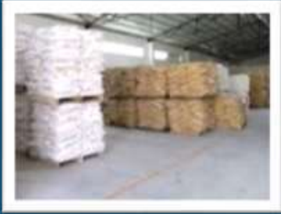
MATERIAL INCOMING SECTION