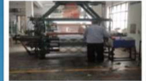
HAND WOVEN Looms

• Reliable • Passionate • Innovative • Responsible