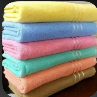
Knitted Terry Towels