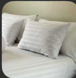
Cotton-Sateen Stripes Sheet Set