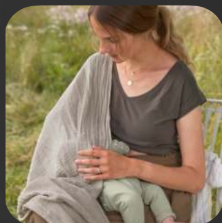
Muslin Nursing Scarf