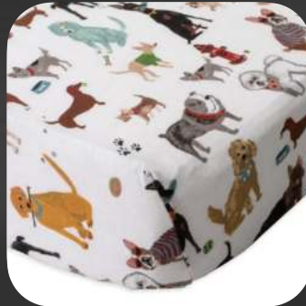
Printed Muslin Crib Sheets