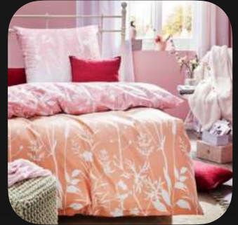
5-Piece Printed Bed Sets