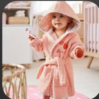
2-Layer Terry Bathrobe