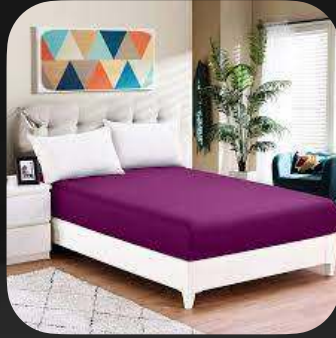
100% Cotton Solid Dyed/ Printed