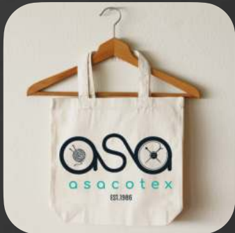
100% Cotton Tote Bag