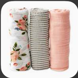
3-Pack Muslin Swaddle

Our mission is to provide innovative and sustainable solutions through products and services which contribute to a better quality of life for our clientele and business partners.