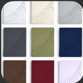
Jersey Fitted Sheet Collection