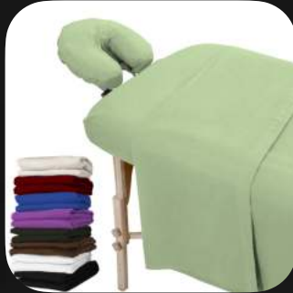
3-Piece Massage Sheet Set