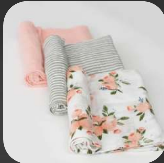
Printed Muslin Receiving Blankets