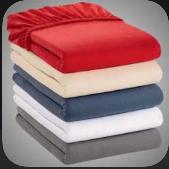
100% Jersey Solid Dyed/ Printed