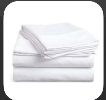
Poly-Cotton Sheet Sets