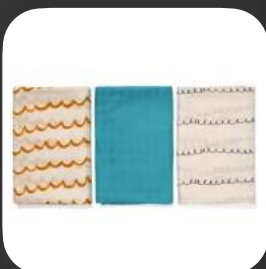
3-Pack Muslin Swaddle Blanket