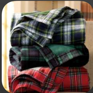
Flannel Receiving Blankets