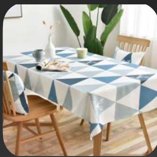
100% Cotton Table Cover