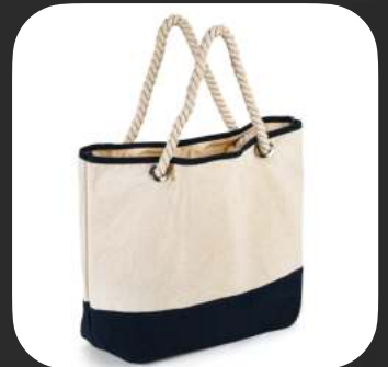
Canvas Bag with Piping and Rope Handle