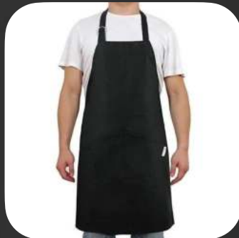
100% Cotton Kitchen Apron