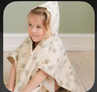
Printed Muslin Hooded Towel