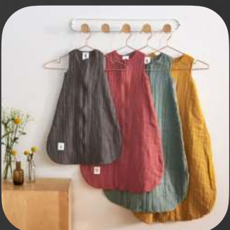
Muslin Sleeping Bags