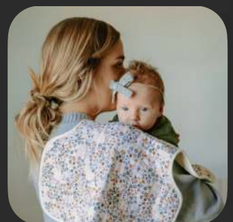
Muslin Burp Cloth