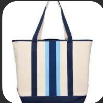
Canvas Boat Bag with Detailing