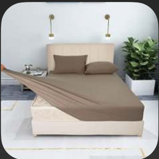
4-Piece Jersey Bed Sets