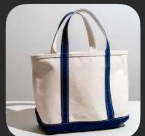
100% Cotton Canvas Bag with Detailing