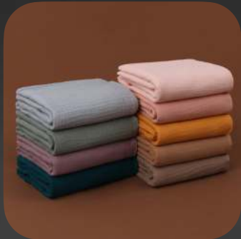
Solid Dyed Muslin Swaddles