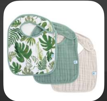
2-Layer Muslin/Terry Bibs