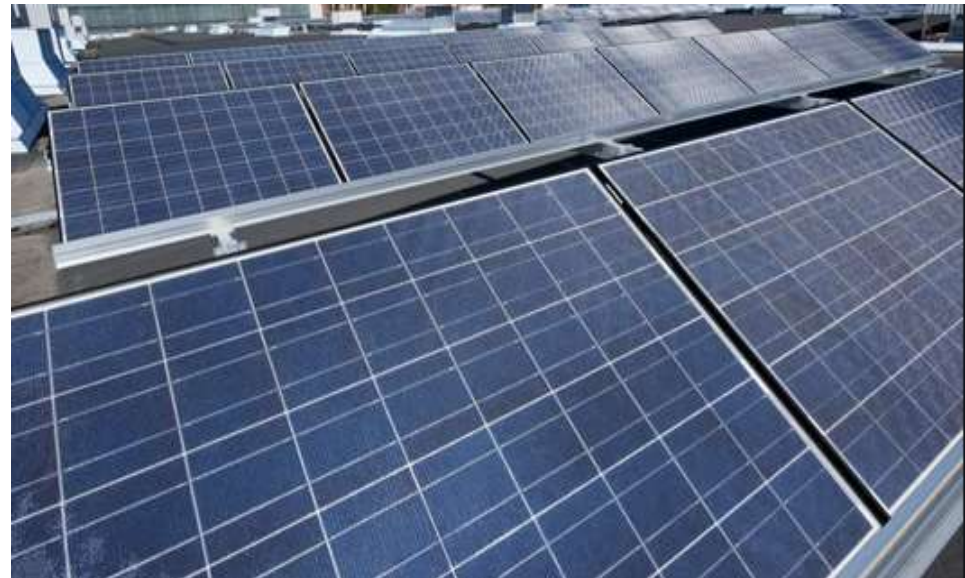
Solar Energy Use