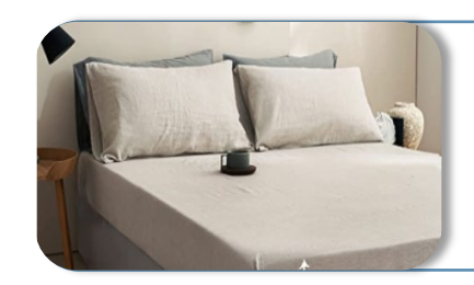
Bedroom: sets, sheets, mattress covers, etc