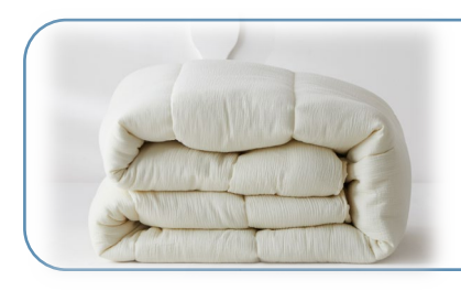
Insert: duvet insert, cushion insert, pillow insert, etc