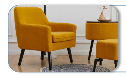
Living room: floor mats, sofas, ottoman, etc