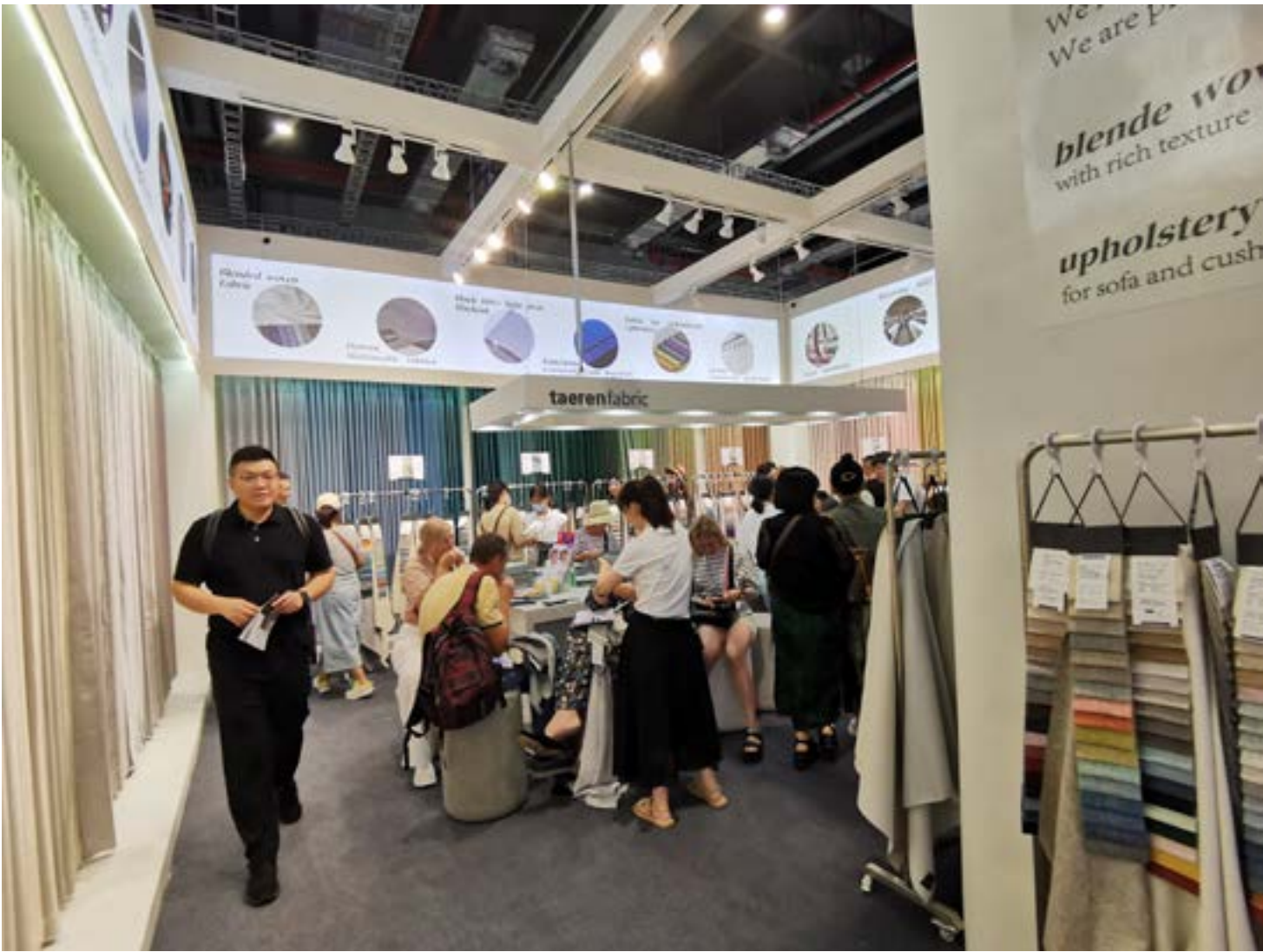
2023 Aug,Intertextile Shanghai