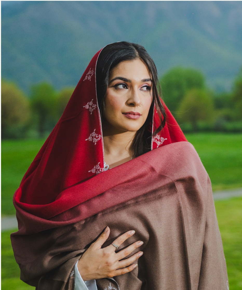
Ombre Pashmina: Where Colors Flow in Harmony