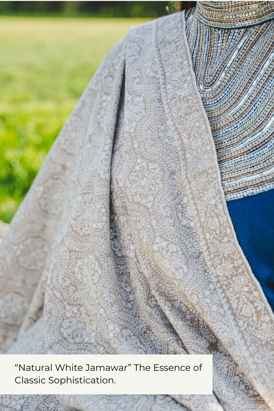
"Natural White Jamawar" The Essence of Classic Sophistication.