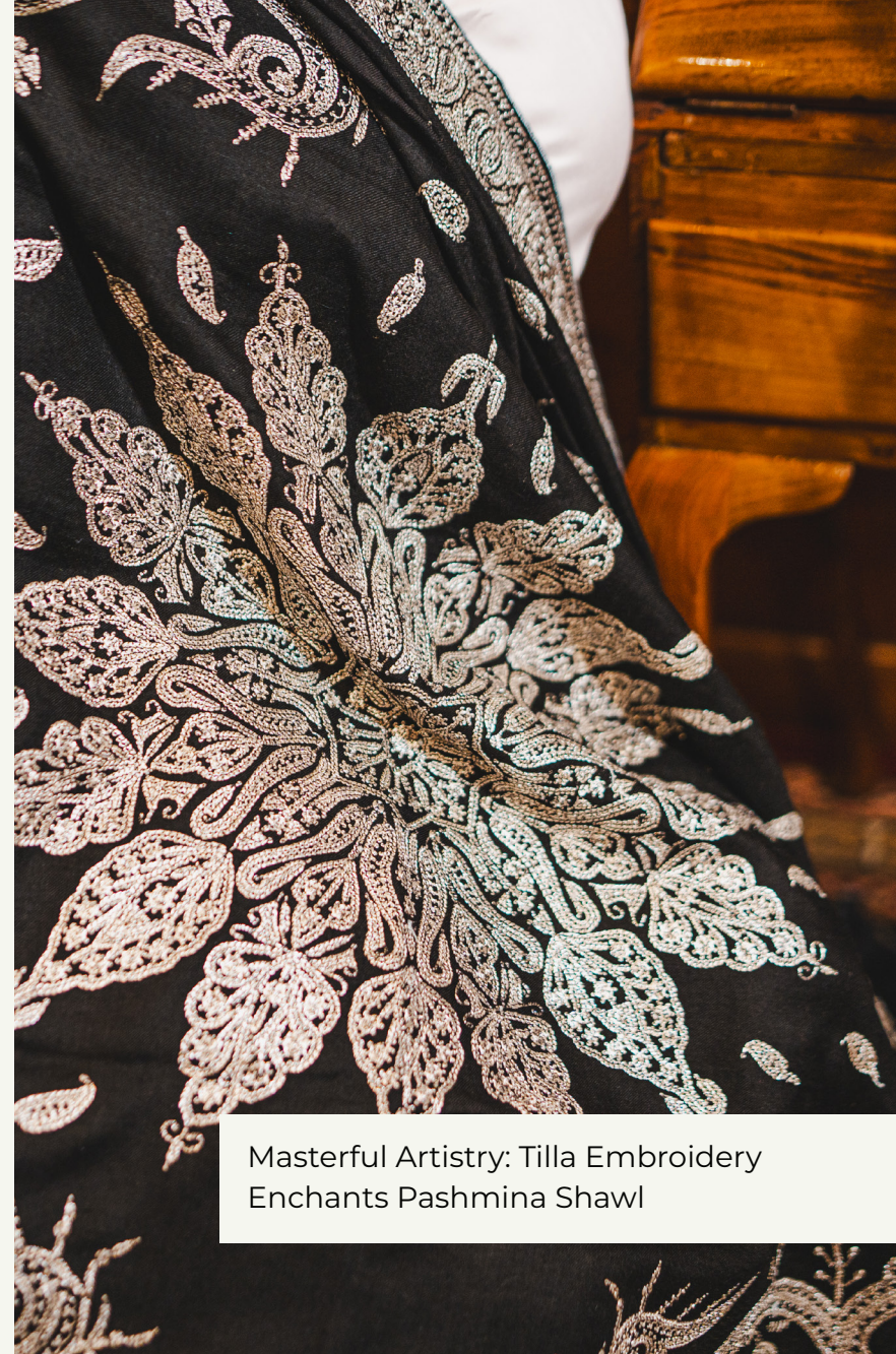
Masterful Artistry: Tilla Embroidery Enchants Pashmina Shawl