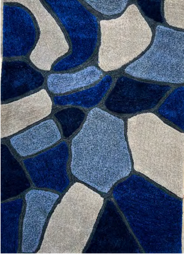
CODE BRICK BLUE