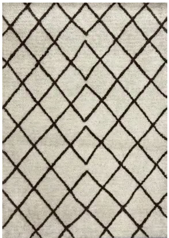
CODE WEAVE WHITE