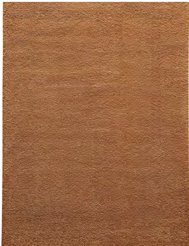
CODE MONO TAN