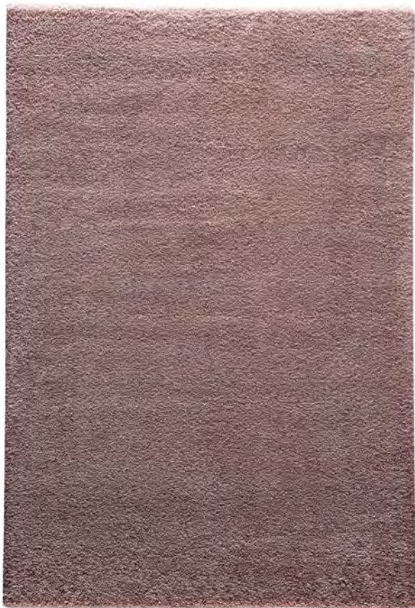
CODE MONO ROSE