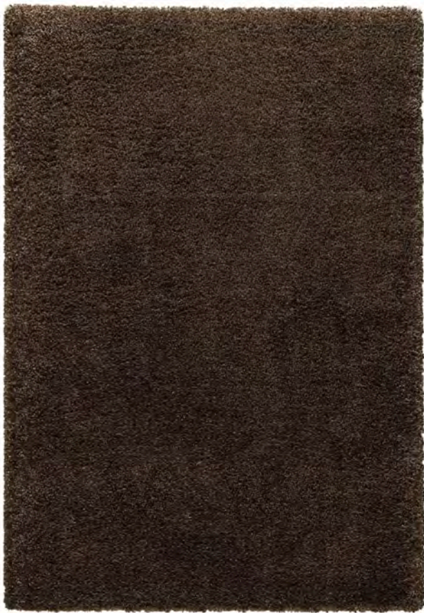
CODE MONO MOCCA