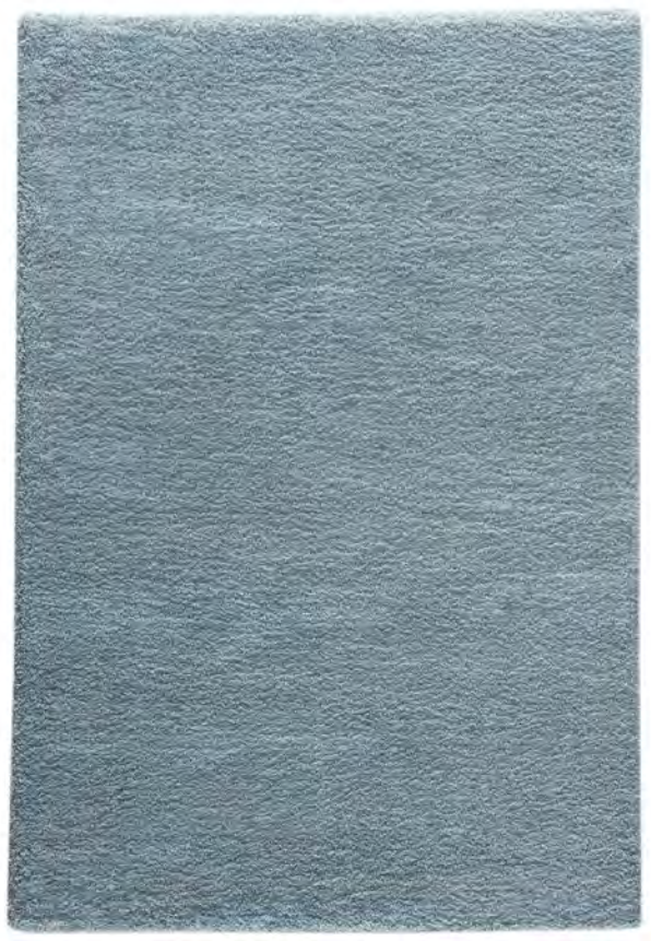
CODE MONO SEA