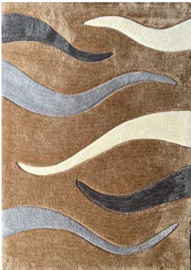
CODE WAVE SAND