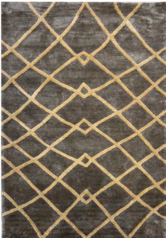
CODE WEAVE TAN