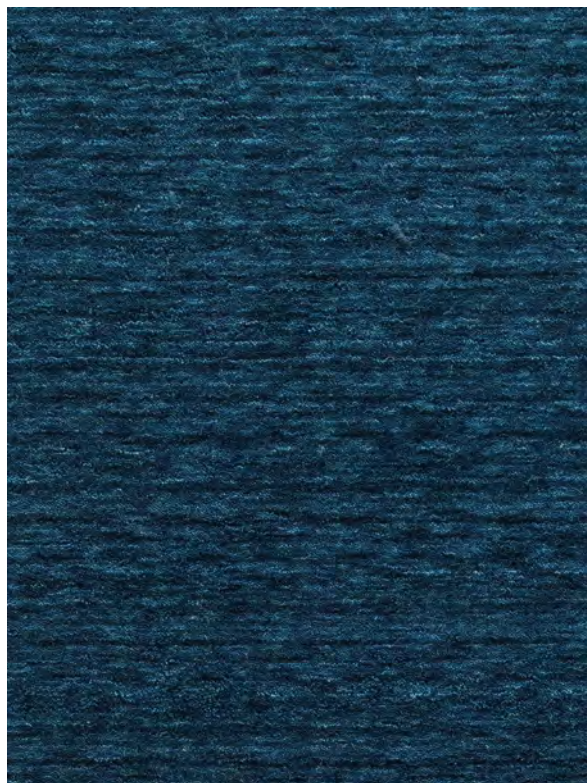
CODE MONO AQUA