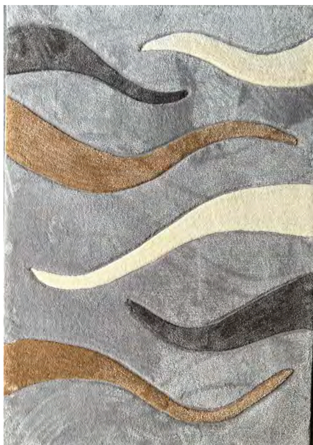
CODE WAVE SILVER