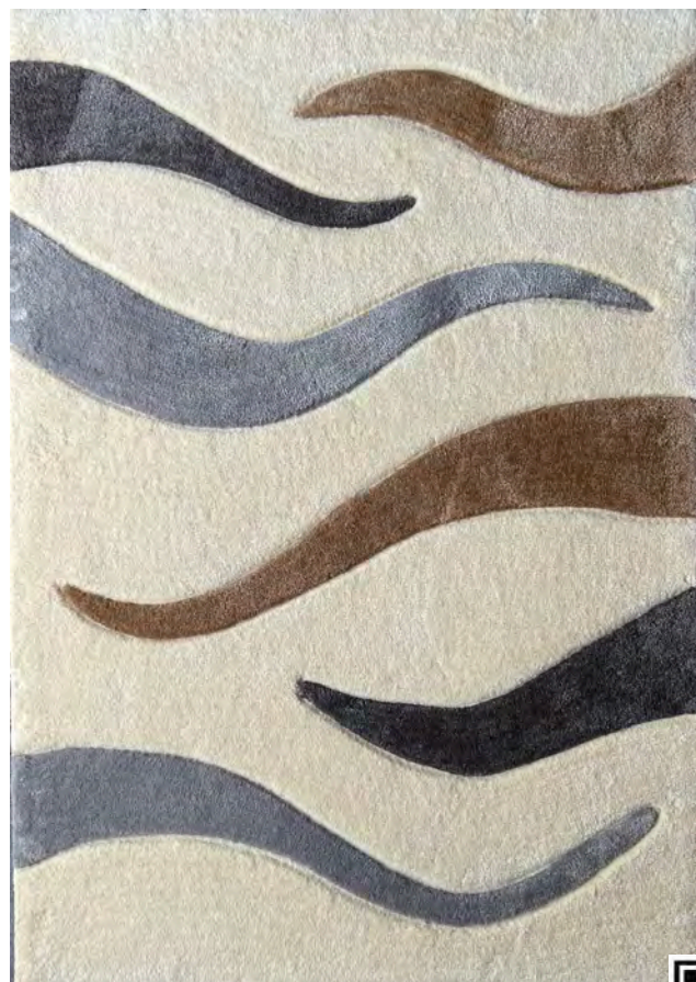
CODE WAVE WHITE