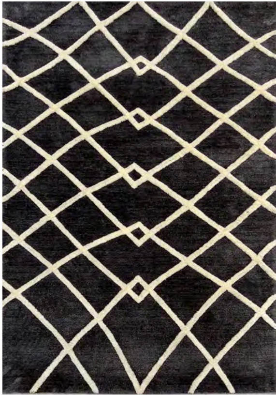
CODE WEAVE CHARCOAL