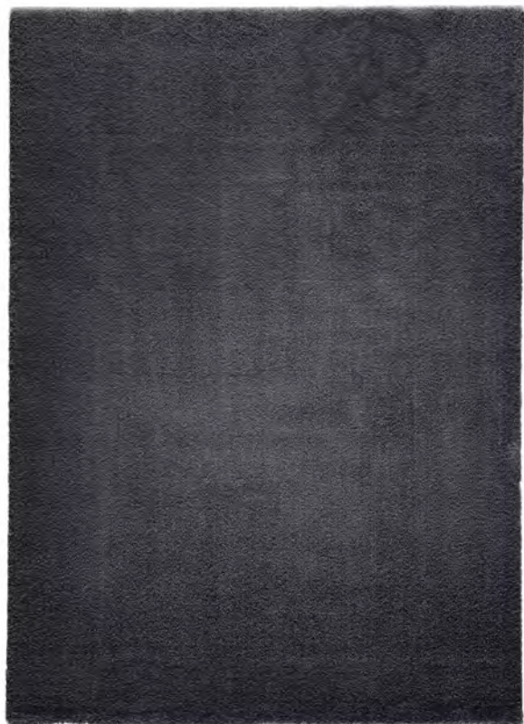
CODE MONO BLACK