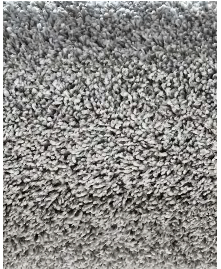
CODE MONO SILVER