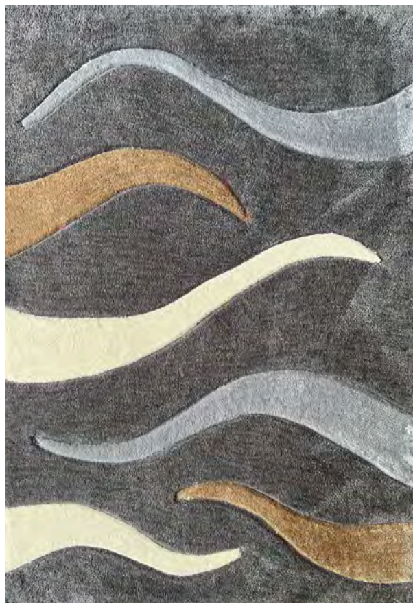
CODE WAVE GREY