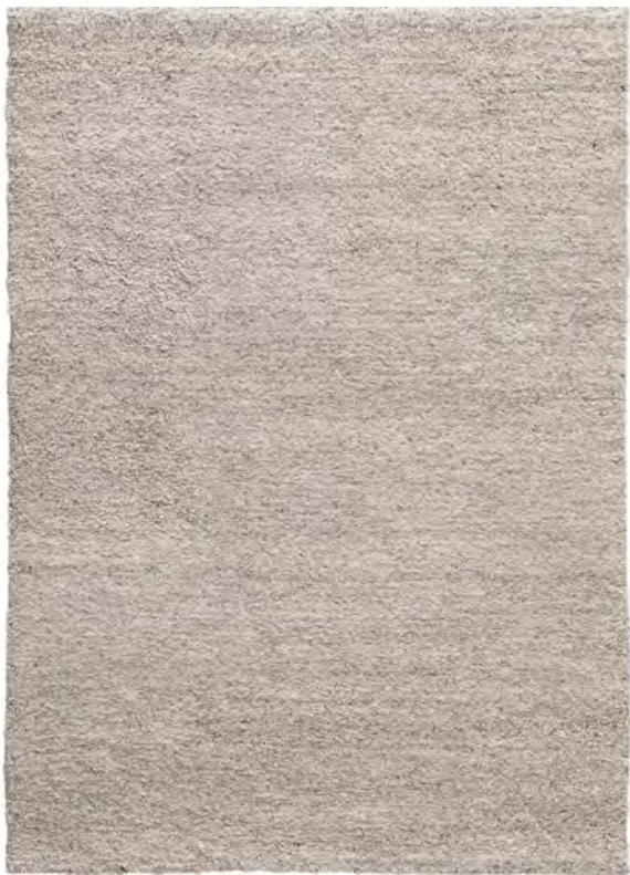
CODE MONO CREAM