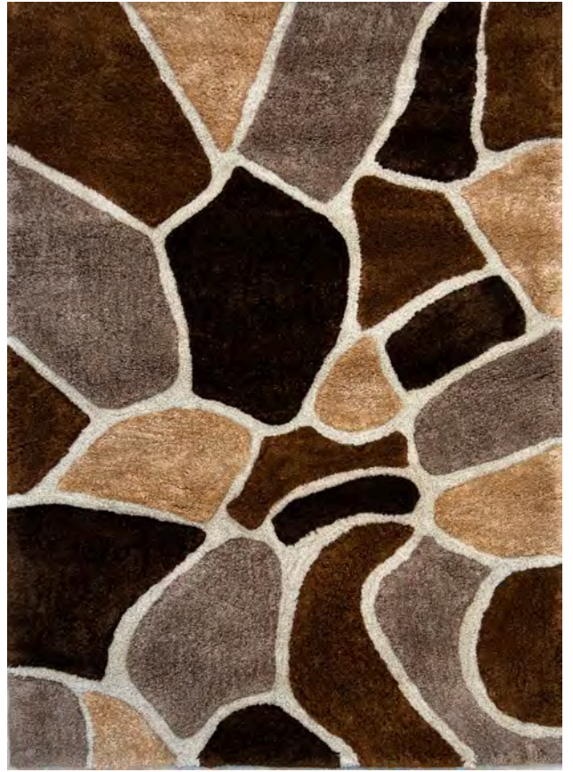
CODE BRICK BROWN