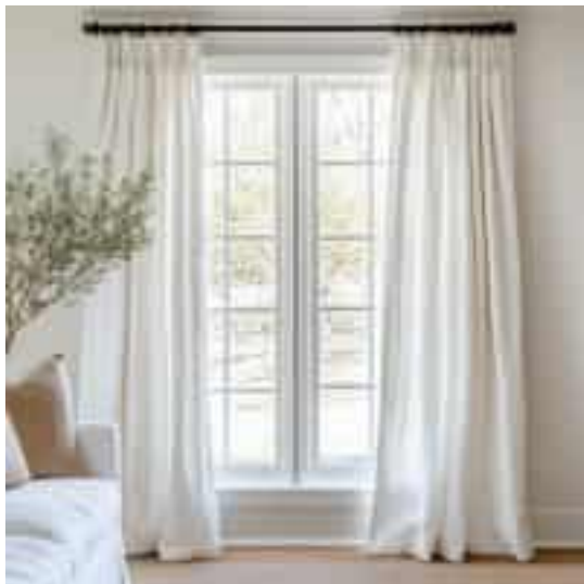
Olivia Custom Linen Blackout Curtains