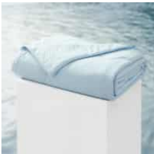
PCM Cooling Comforter