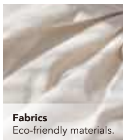
Fabrics Eco-friendly materials.