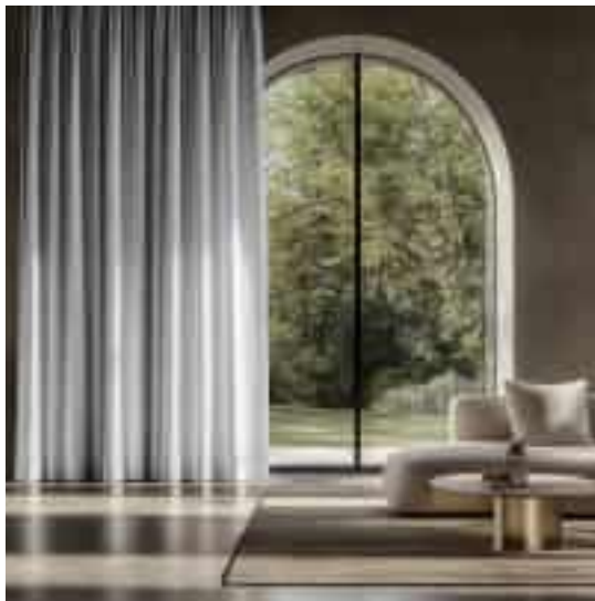
Solene Custom Linen texture 100% Total Blackout Curtains