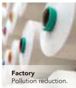
Factory Pollution reduction.