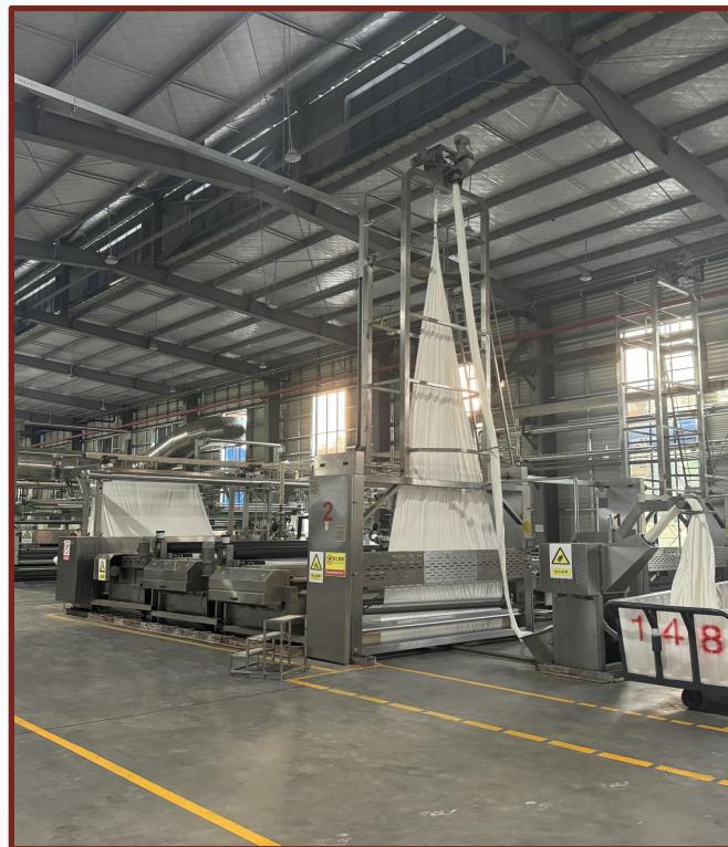
2 SETS OF COMBINED OPEN WIDTH WASHING AND WOOL WASHING MACHINES