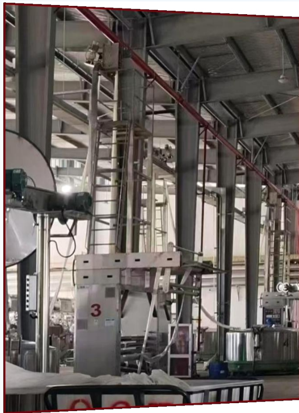
4 OPENING MACHINES