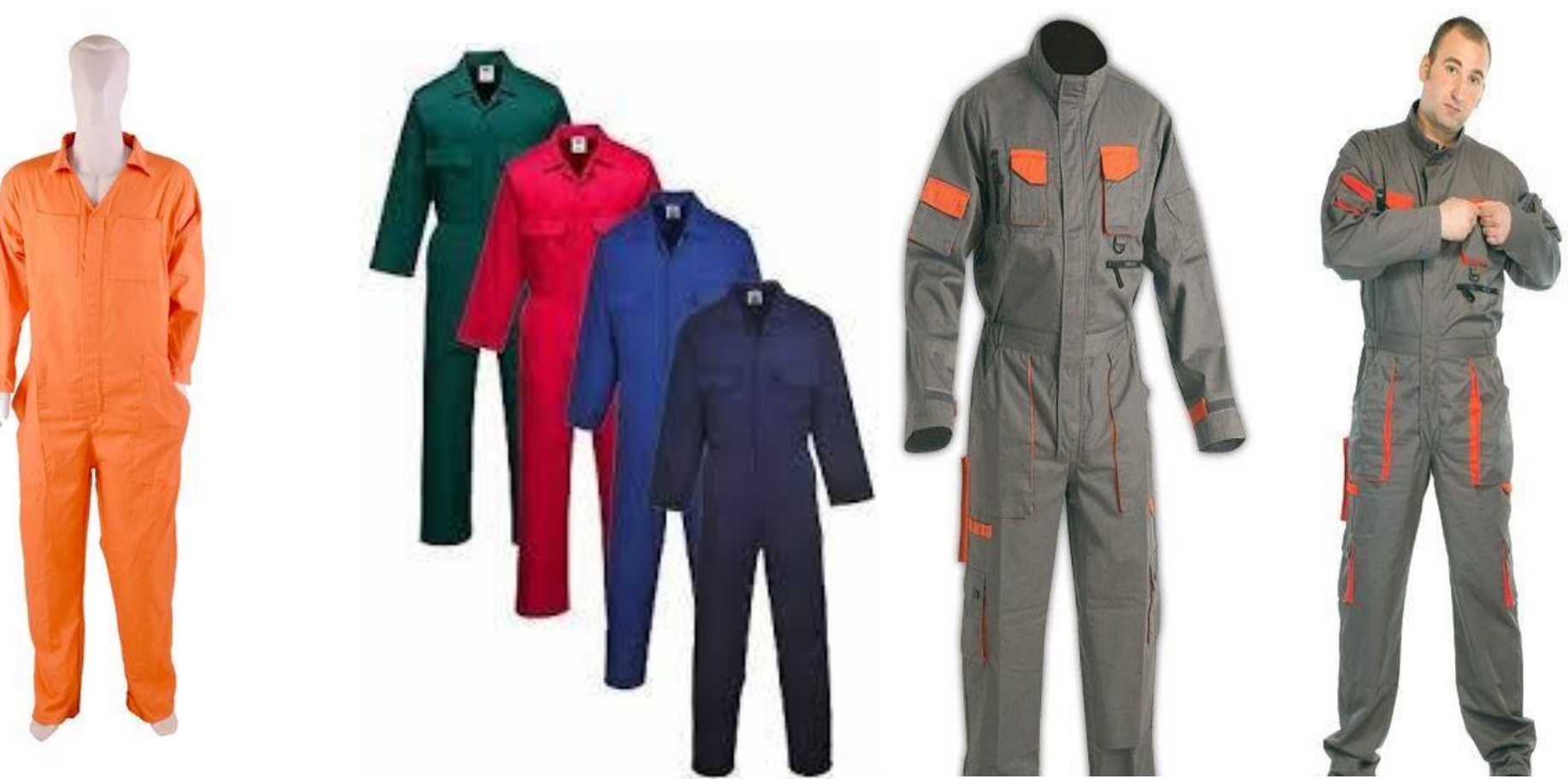
Work Wear Fabrics & Uniforms