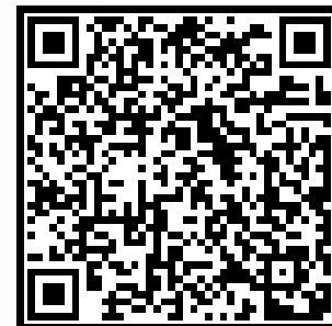
Holly Wise Chair

This WRAP certificate covers the facility with the address and production processes listed above. Please refer to the full audit report for details.