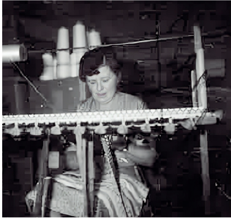
bmfabrics: quality & tradition since 1949